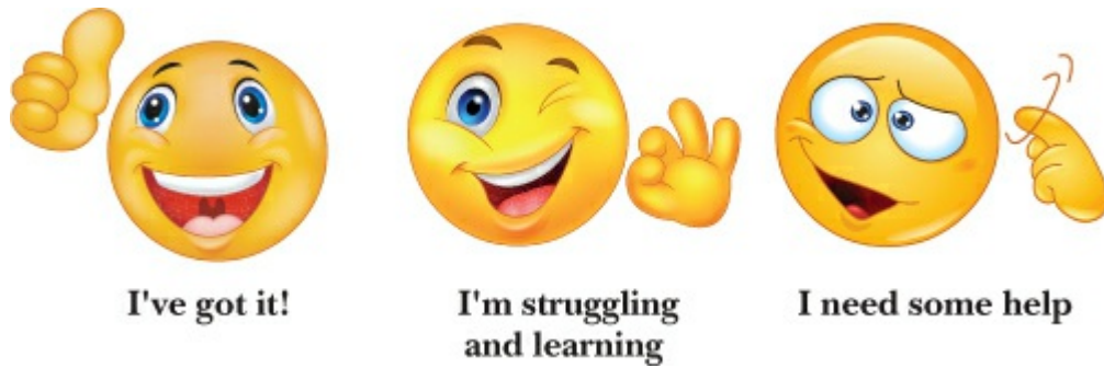
Figure 8.4 Self-reflection faces

Both options prompt students to consider what they have learned and what they need to learn.